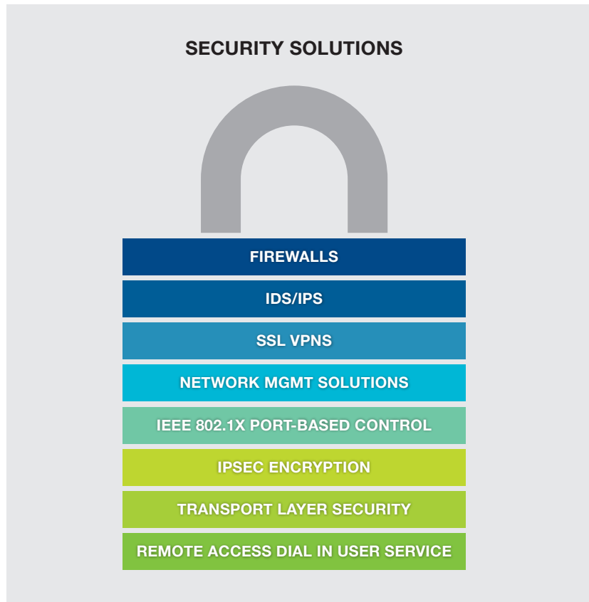
FIGURE 2 Security Solutions